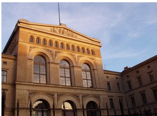
Humboldt Graduate School